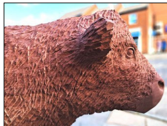
Brita Green r

A month after the unveiling the Flower Parade brought in crowds of visitors. Late morning I sat under The Pied Calf tree for an hour and watched. The sheep were popular. Five adults posed for photos standing by or seated on them; ten children, all sitting. And 64 other people interacted with the sculptures in some way – photographing the whole flock, pausing and talking about them, patting, resting a shopping bag, sitting, stroking them as they passed ..... No-one seemed to be slamming the Council.